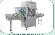
AUTOMATIC TRAY SEALER