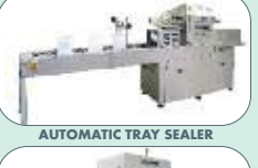
AUTOMATIC TRAY SEALER