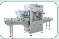
AUTOMATIC TRAY SEALER