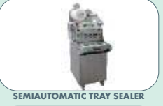
SEMIAUTOMATIC TRAY SEALER