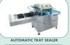
AUTOMATIC TRAY SEALER