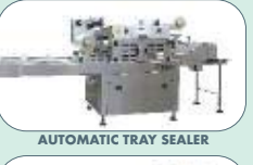
AUTOMATIC TRAY SEALER